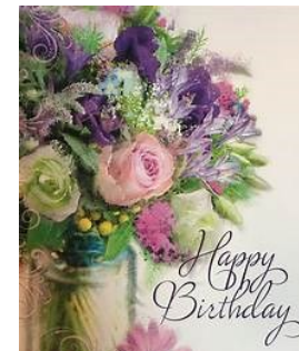
Friday, Kelly Crowl!

Please replace the three deacon pages currently in your directory with these two new pages.